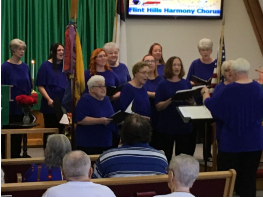
Flint Hills Harmony performs at St. Peter's United Methodist Church on August 25th.

initiated the program by becoming the first Diamond Patron.